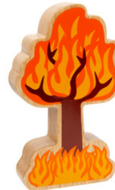
NC805 tree on fire