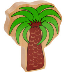
NC886 tropical tree