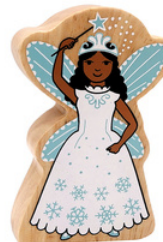
NC616 snow fairy