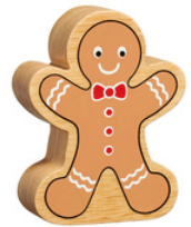
NC594 gingerbread man