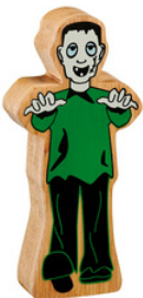
NC611 tabby cat