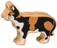
NC112 tabby cat