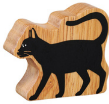
NC143 black cat