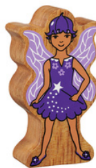
NC615 bluebell fairy