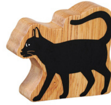
NC143 black cat