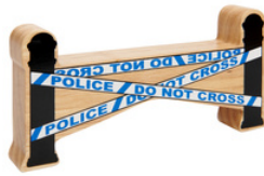
NC801 police barrier